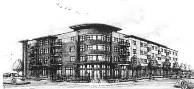
Spirit on Lake the new home for Quatrefoil Library located at 13 & Lake Street