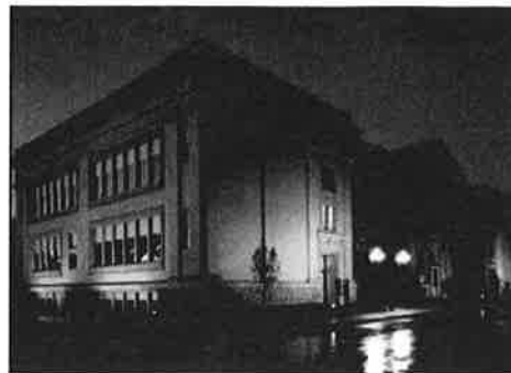
(Richards Gordon Building)

As part of the transition of moving the Quatrefoil Library to its new home at Spirit on Lake in Minneapolis the library will close its doors at the current location at the Richards Gordon building in St. Paul at the end of the day on Sunday, September 29, 2013. The library will shut down for the entire month of October. Books and DVDs will be unavailable for checkout. The library will still accept returns during the month of October at Richards Gordon. It is expected the library will open its new doors at Spirit on Lake in early November 2013.